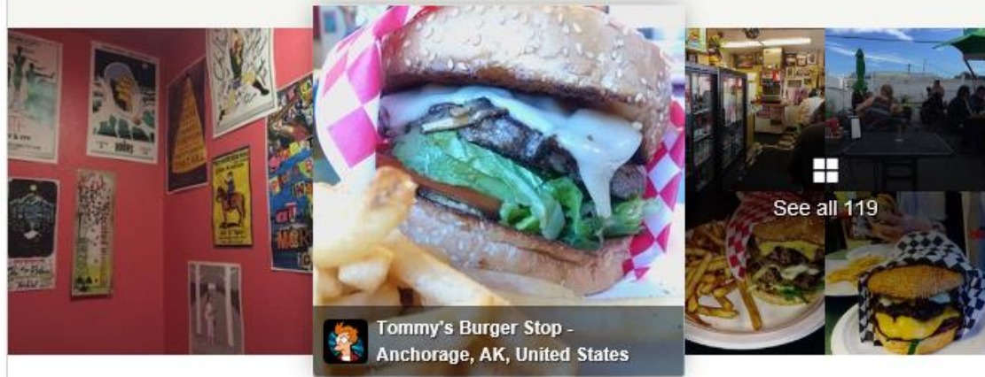
Tommy's Burger Stop - Anchorage, AK, United States